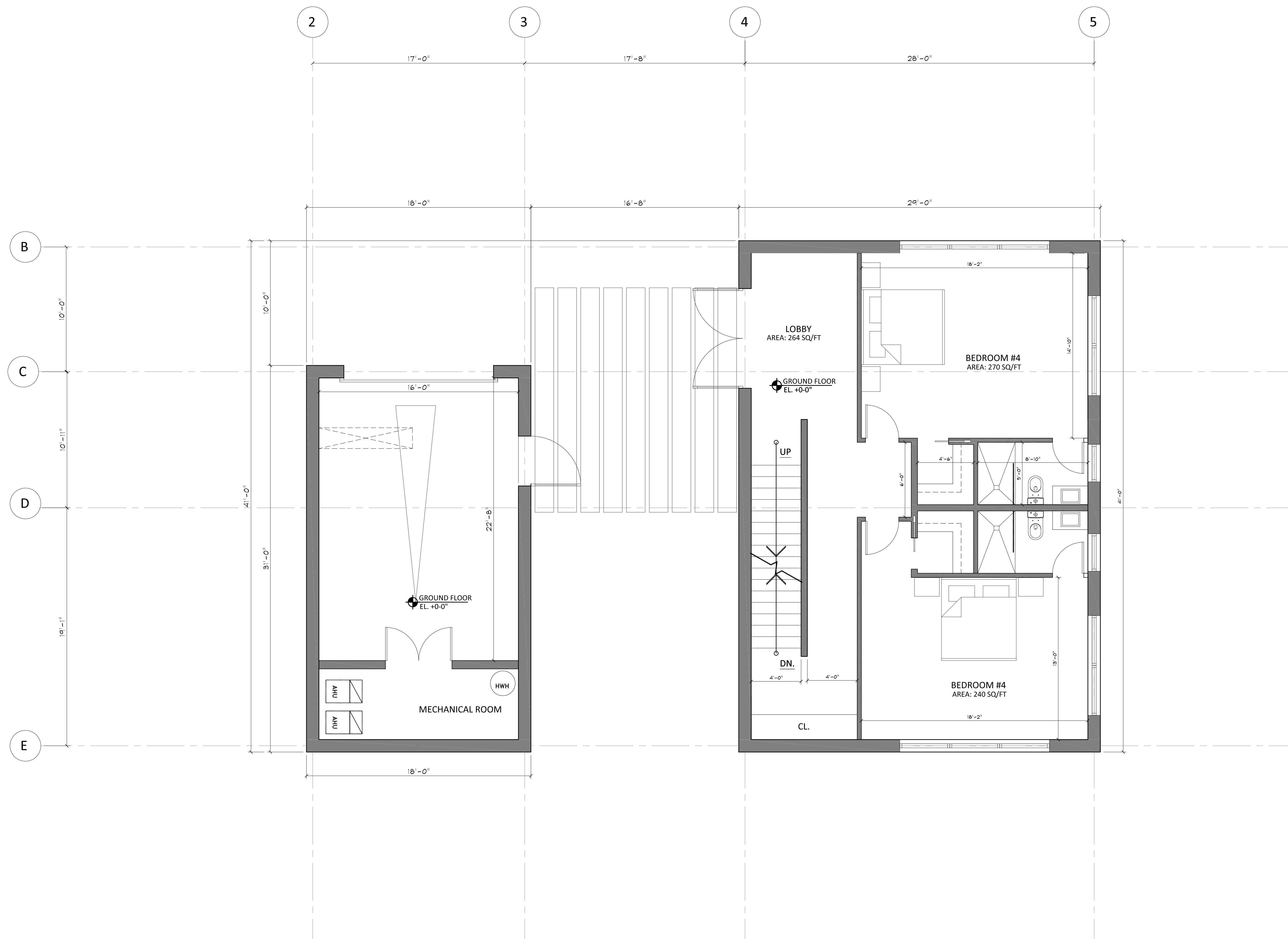
GROUND FLOOR PLAN ESC: 1/4"=1'-0"